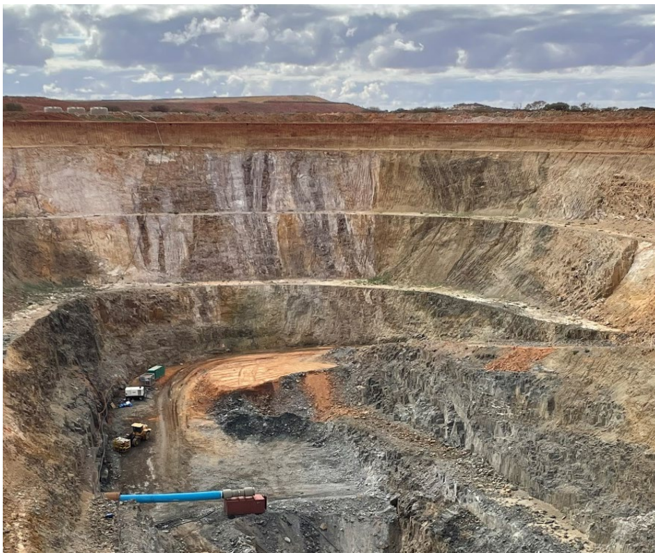
Figure 1: Fender Underground – Portal to Left