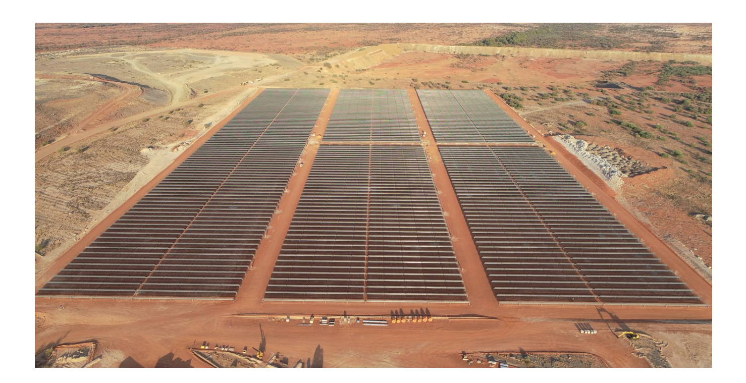
Westgold's New Solar Farm at the Bluebird Processing Hub, Meekatharra