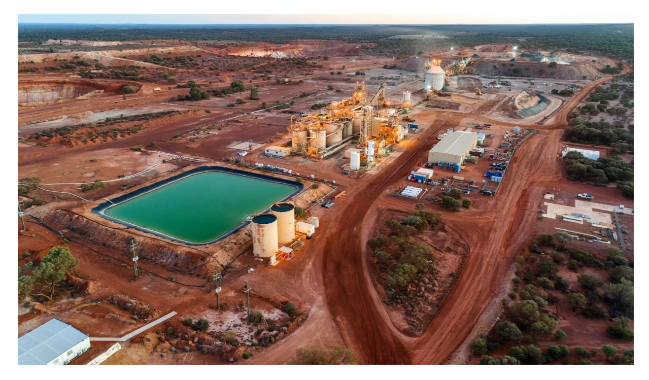
Figure 1 – Westgold's 1.4Mtpa Tuckabianna Processing Hub – 40km from Musgrave's Cue Gold Project