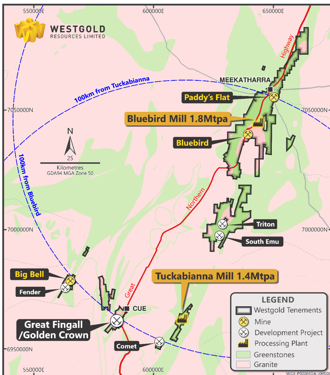
Figure 2: Westgold’s Murchison Operations

Westgold continues to systematically advance the PFS for Board review in Q4, FY23, with drill hole 22BBDD0120A a high priority resource definition target that our geology team is now aggressively pursuing in order to maximise the value of our flagship asset.”