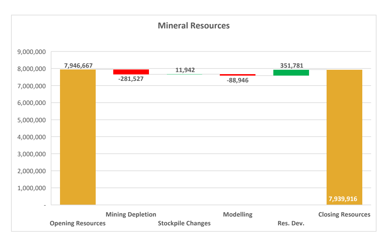
Figure 2: Resource Inventory Change FY22

The year-on-year Mineral Resource Estimate inventory change is shown in Figure 2 below.