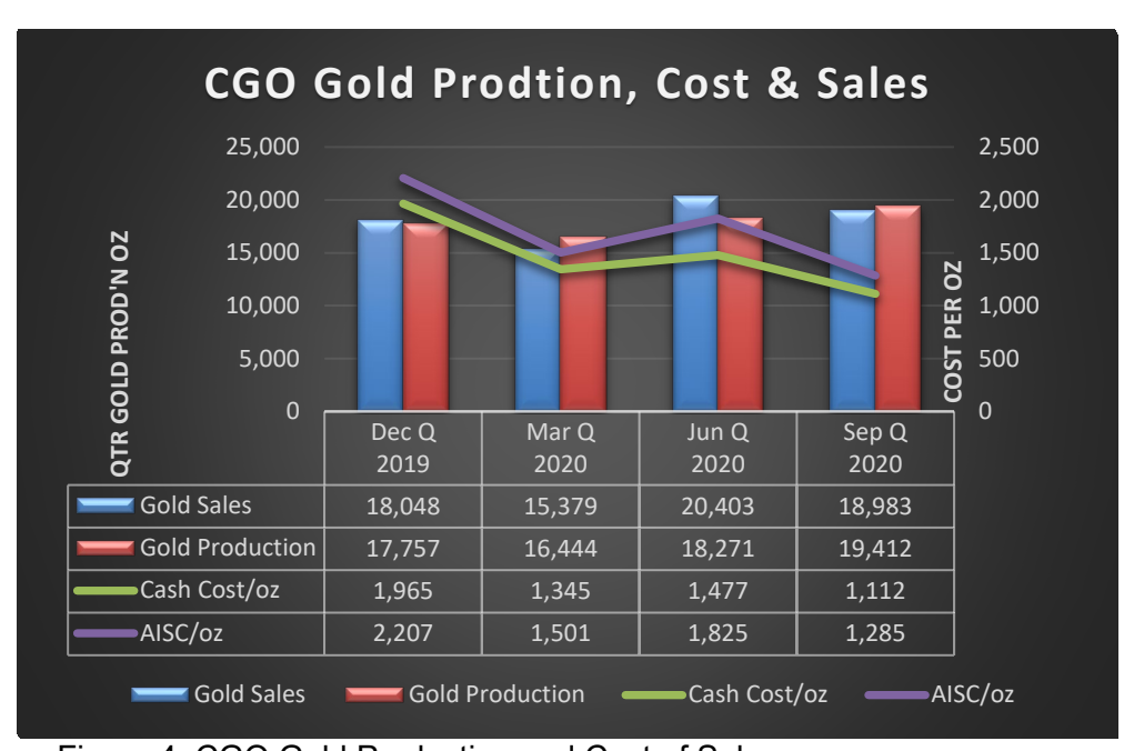
Figure 4: CGO Gold Production and Cost of Sales

Quarterly performance over 12 months is illustrated in Figure 4 below: