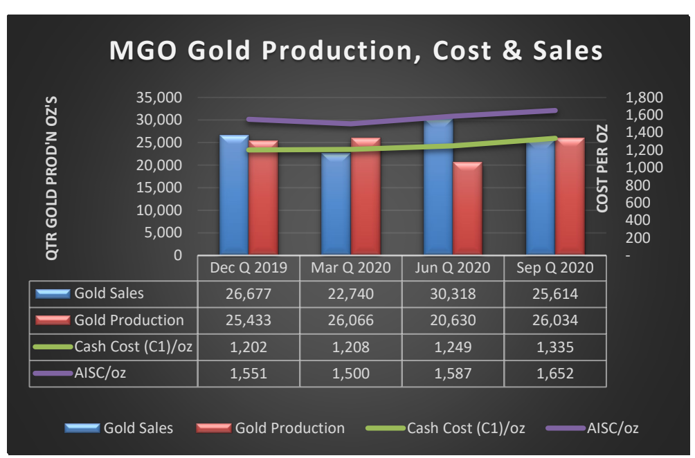
Figure 3: MGO Gold Production and Costs

Quarterly performance over 12-months is illustrated in Figure 3 below: