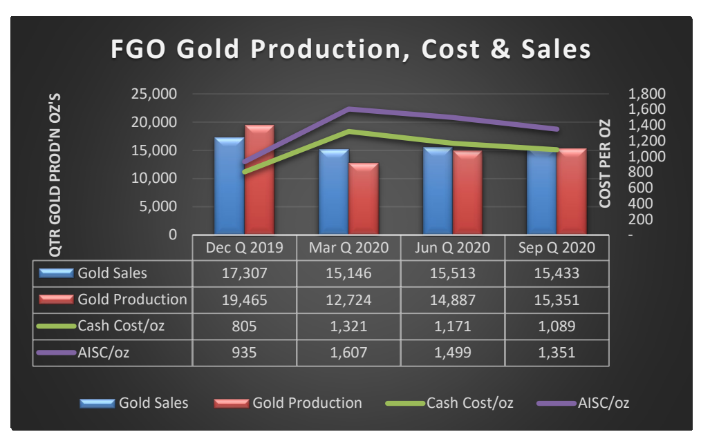
Figure 1: FGO Gold Production and Costs

FGO performance over 12-months is illustrated in the Figure below.