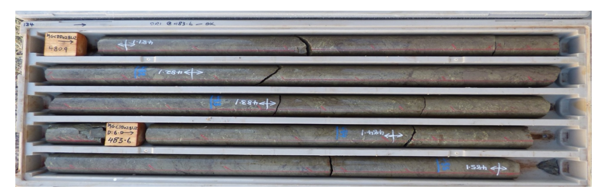
Core from interpreted Smith's United intercept

Additionally, the hole also intersected what has been interpreted to be the down-plunge projection of the Smiths United lode, where it progresses from the traditional host Great Fingall Dolerite into the surrounding Hangingwall Basalts. Significantly, this mineralisation manifested as a massive sulphide intercept, and was not only auriferous, but heavily endowed with both copper and zinc, opening up an exciting new base metals exploration target with a result of 6.3m at 3.71% Cu, 3.73% Zn and 0.73g/t Au from 479.76m .