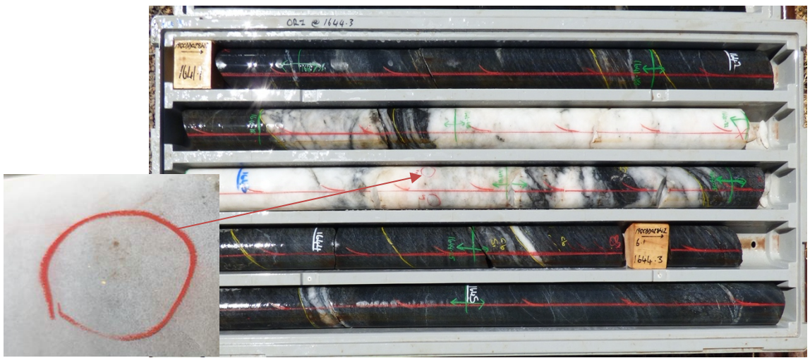
Visible gold in the core

The main Great Fingall intercept of 1.57m at 7.98g/t from 1642.18m included a section of 0.49m at 0.12g/t from 1642.92m which contained numerous specs of visible gold (see image). Given the fine specs of visible gold in the core and the resultant assay returned, this section has been re-submitted for screen fire assay.