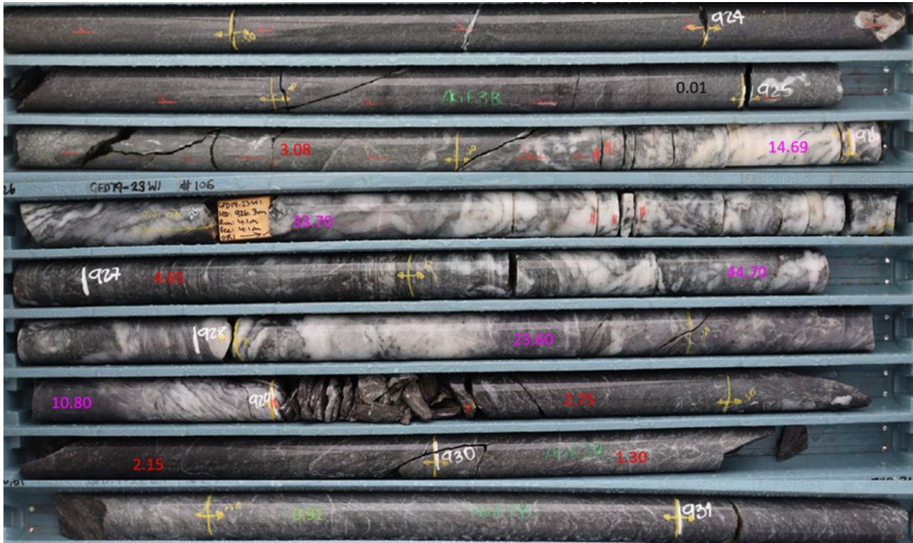
Figure 2 - Lower Fingall Reef in Hole GFD019_23W1 Returned 5.50m @ 16.68g/t Au (Assays Annotated)

All three holes intersected the predicted positions of the Upper and Lower Fingall Reefs and returned highly encouraging intersections as summarised in the Highlights section and detailed in Appendix A .