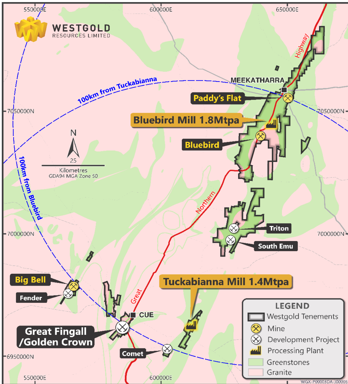
Figure 3 - Westgold's Extensive Murchison Assets Extending from Cue to Meekatharra